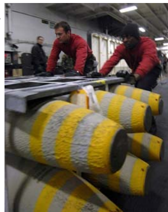
Physical work is still required today!