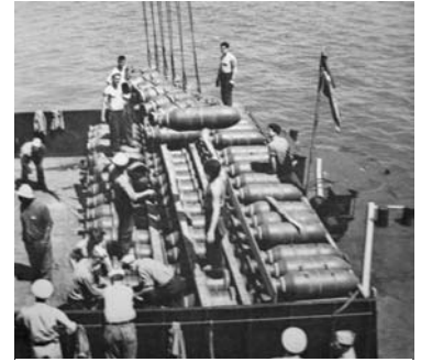
Loading ordinance in my day.

Is more ordnance brought aboard today? I would