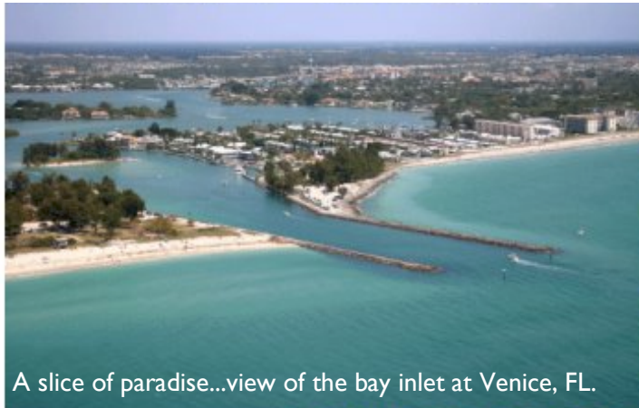
A slice of paradise...view of the bay inlet at Venice, FL.

all for attending and extend the invitation to attend next year. Share the news with your friends...even those who served on other ships and maybe in our area. Come one, come all. Sailors and Marines welcomed!