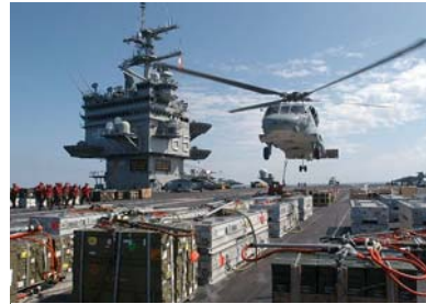
Helicopters moving ordinance...I do not recall that ever happening during my time on Coral Sea.