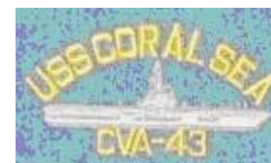
Ship's Logo CVB, CVA, CV