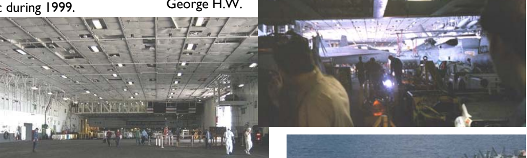
Hanger Deck Comparison—2005 on left, 1999 shown upper right

To simulate being a sailor at home: Raise your bed to within 6 inches of the ceiling so you can't turn over without getting out and then getting back in.