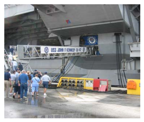
The tour group boarding the JFK.

There is only one conventional powered aircraft carrier remaining in the fleet. That is the Kitty Hawk (CV-63) and its decommissioning is planned for 2008. USS George H.W.