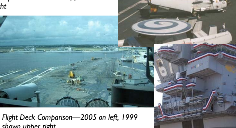
shown upper right.

What will be the final resting place for the IFK? Will it be torn apart like the Coral Sea, become a Museum (in Boston?) like the Midway, sunk