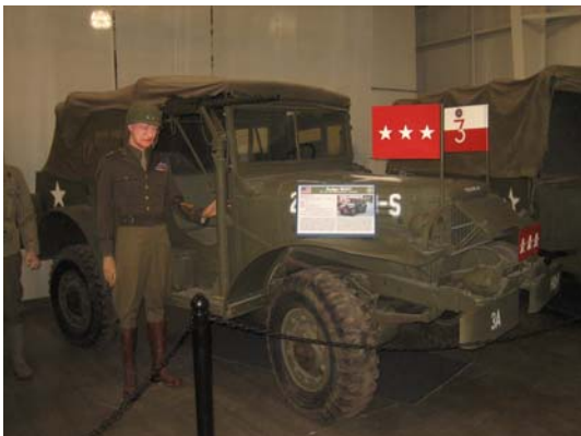
Patton's Command Car—displayed in the museum.

Saturday was a full day of sea stories. The ladies continued their trips to favorite places on Saturday that began on Friday.