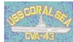
Ship's Logo CVB, CVA, CV

Credit Card Number _____ Exp. Date _____