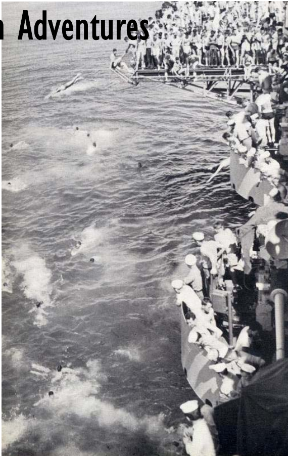
1954 "Swim Call" in the Med.

Once in a much greater while a Beach Party might be scheduled. I recall only one. When the participants returned they talked about the 3.2 beer. I remember the beer being stored below the