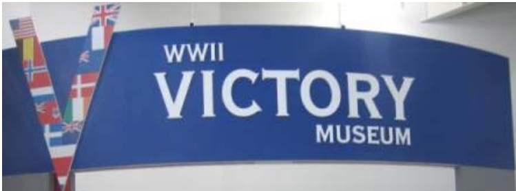
Entrance— to The Victory Museum in Fort Wayne/

still young the sea stories began and continued to all hours of the night.