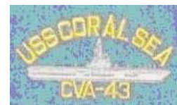
Ship's Logo CVB, CVA, CV

Credit Card Number _____ Exp. Date _____