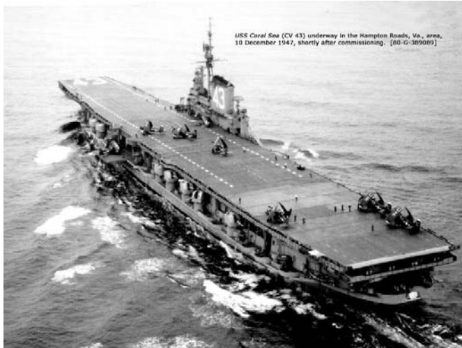
USS Coral Sea (CV 43) underway in the Hampton Roads, Va., area, 10 December 1947, shortly after commissioning. [80-G-389089]