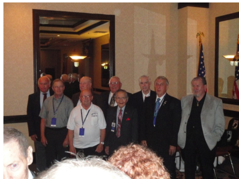
Several Coral Sea (re-commissioning) Plank Owners were in attendance at the reunion.

walk. The hotel address is 217 N. St. Mary’s St. San Antonio, TX 78205. The telephone is 210-224-2500. Room rates are $86.00 per night, plus tax, for a total of $100.41 per