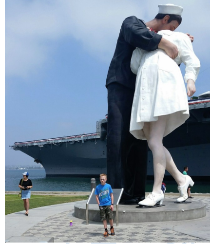
of our sightseeing agenda and the planned tour activities:

You still have time to complete and submit both the reunion hotel reservation form and the USS Midway tour form on page 3 of this issue. The San Diego City Tour form can be found on page 2. This must be completed and mailed separately, with payment, to the address shown on the form. Here is a brief summary