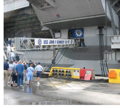
The tour group boarding the JFK.