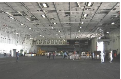
Hanger Deck Comparison—2005 above, 1999 shown upper right.

There is only one conventional powered aircraft carrier remaining in the fleet. That is the Kitty Hawk (CV-63) and its decommissioning is planned for