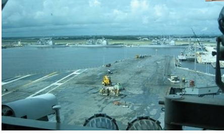
Flight Deck Comparison—2005 shown above, 1999 shown upper right.