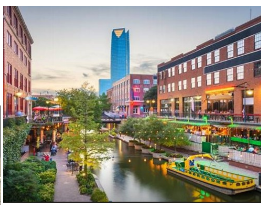
Oklahoma City's Bricktown entertainment district is industrial and chic. It is known for its many vibrant entertainment venues housed in repurposed factory spaces.