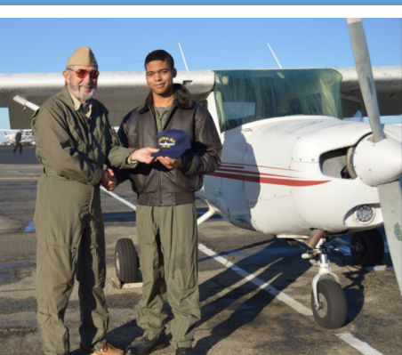
day going through the "Planes of Fame" Air

first passenger. We flew from The Cable Airport (USNSCC home airfield) to Chino Airport, Calif., where we spent the